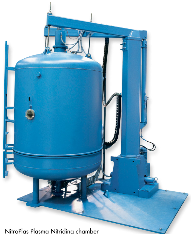
NitroPlas Plasma Nitriding chamber 5 tonne capacity Chamber Capacity 1.2m diameter x 1.5m high