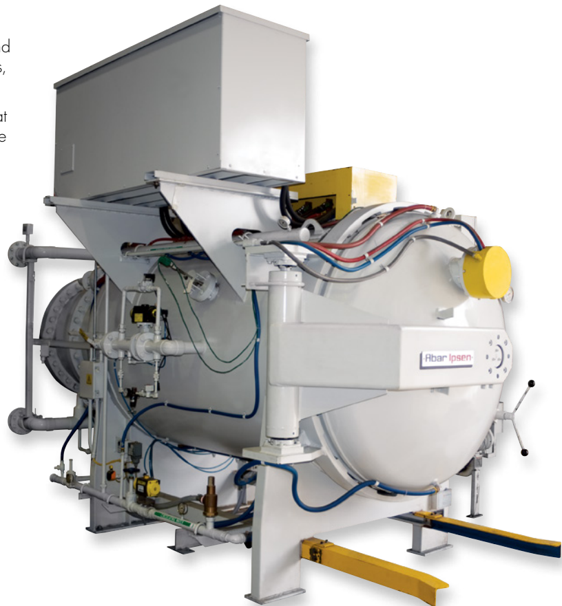
12 bar TurboTreater® vacuum furnace 1 tonne capacity Furnace Capacity 600mm x 600mm x 1000mm

Our experienced technicians accurately record all processing parameters and monitor all processing variables. They will work directly with your material, design or manufacturing engineers to determine the optimum processing methods to meet your requirements.