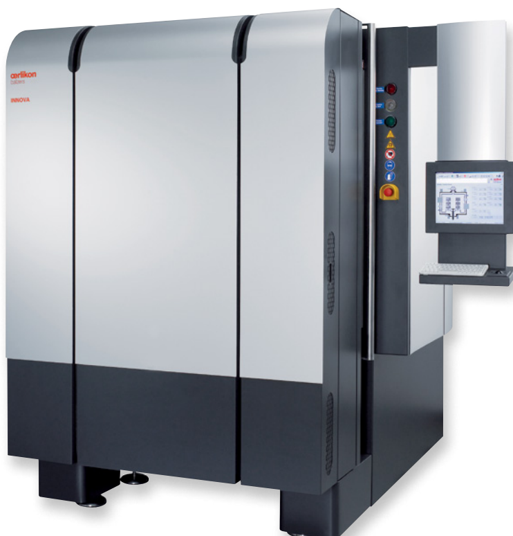
Oerlikon Balzers INNOVA PVD coating unit 500kg capacity